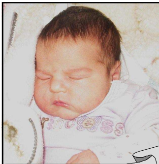
The Little Ones