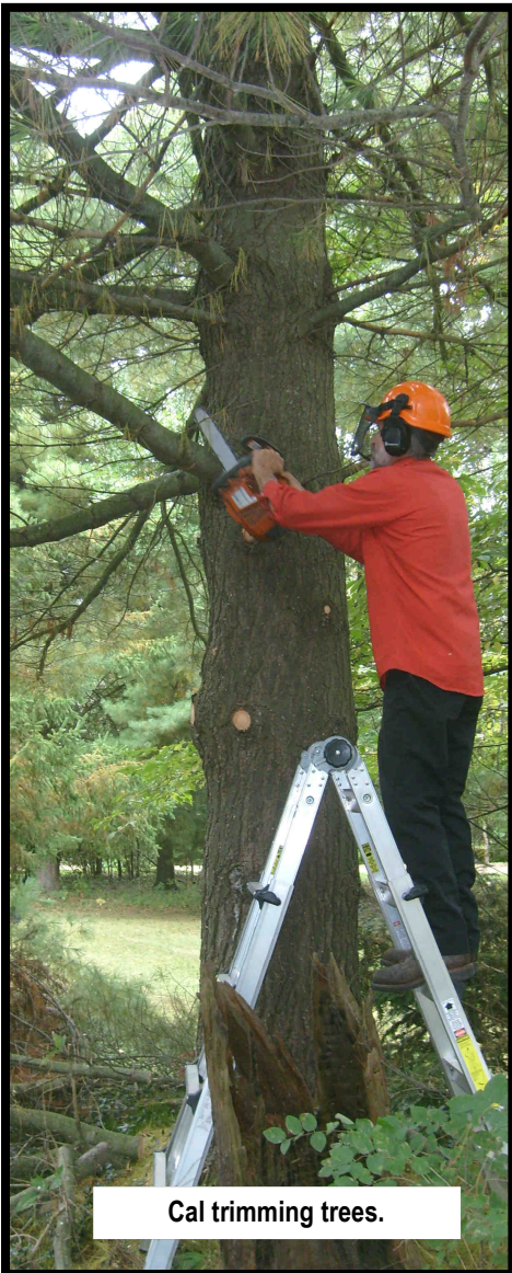
Cal trimming trees.

Love and best wishes—God bless you all, Grandma.